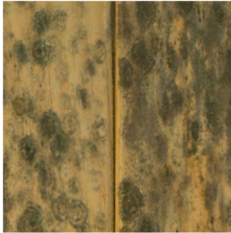
Pressure treated timber that mould has been allowed to grow. The difference between the treatments salts and mould is quite clear.