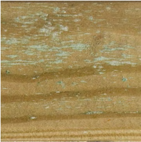
Pressure treated timber with some speckling left by the treatment salts.

Many of our products have been pressure treated so they last for many years. When pressure treating timber, a liquid preservative is forced into it in order to protect against deterioration due to rot or insect attack. In the treatment process finished timber is placed in a large container and filled with the preservative solution (normally greeny-blue in colour). As the pressure in the container is increased, the preservative is forced into the timber. The excess preservative is drained from the container and recycled. As the timber dries some of the liquid evaporates from the timber surface, this can leave deposits of treatment salts on the timber surface, visible as greeny-blue speckles that can vary in severity. The speckling is very easily mistaken for mould. The pictures below show the difference between mould and speckling left by the treatment. In all cases where the treatment salts are visible on the surface of the timber they can be left as over time they will fade. However, you can speed up the process by either pressure washing the timber and/or as we have done here, lightly sanded the effected area. reducing its appearance. Leaving what remains to fade as the timber naturally weathers.